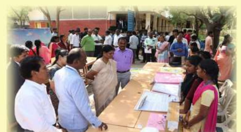
Cunnan Innovation Incubation Cell