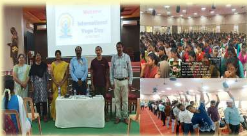
Yoga and Meditation