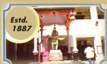
Dharmamurthi Rao Bahadur Calavala Cunnan Chetty's Hindu Higher Secondary School (Aided), Tiruvallur - 602 001.