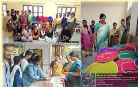
ED Cell and IIC