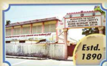
Dharmamurthi Rao Bahadur Calavala Cunnan Chetty's Higher Secondary School (Aided), Perambur.