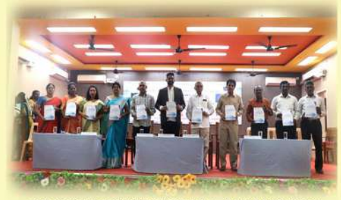
TWO DAY INTERNATIONAL CONFERENCE DEPARTMENT OF COMMERCE