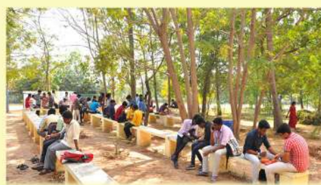
Boys Waiting Lounge